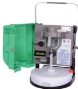
Portable Aquacell P2-COMPACT