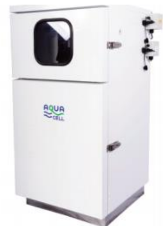
Stationary, Refrigerated Aquacell S320H