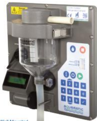
Wall Mounted Aquacell S50

Prøvetakeren kan også leveres med kjøleboks