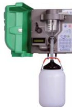
Wall Mounted Aquacell S100 with optional Suspension Bracket and 10ltr Container